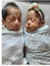
God's Precious Blessings