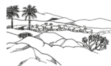
stood on rocks