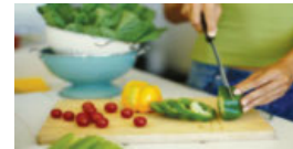
Table at St. Thomas

September 14th, 2024 St. Thomas the Apostle Church 333 Highway 18, Old Bridge, NJ