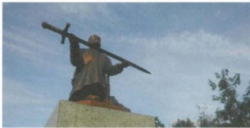
Picture: St. Ignatius of Loyola handing over his sword to God so that he can take on a new life in Christ.