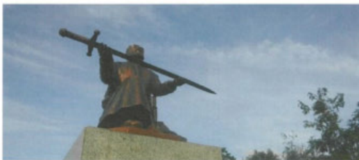
Picture: St. Ignatius of Loyola handing over his sword to God so that he can take on a new life in Christ.

Most of us wish we could be more effective in handling our feelings, careers, relationships, problems..etc. We don't often realize, however, that what holds us back is the hundreds of little anchors that prevent us from sailing into more promising waters. Life becomes a "drag" because we drag around so much baggage. When Jesus calls us to him, he often asks us to venture out into deeper waters...to make changes in our life. Jesus asks each of us to be "fishers of men"...to bring others to him...to pray for them, encourage them, support them, be hospitable to them, as they journey with this community of faith. Our catechumens and candidates have accepted that invitation to venture out into deeper waters. It is important that we assure our catechumens and candidates that they have our prayerful support as they venture out to answer the Lord's call. Please keep them in your prayers!