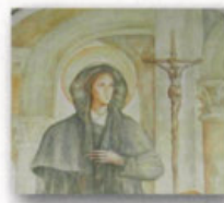
"My trust is in the Lord, and I stand ready for whatever he sends." St. Lucy Filippini

The Religious Teachers Filippini invite you to a day of extraordinary grace.